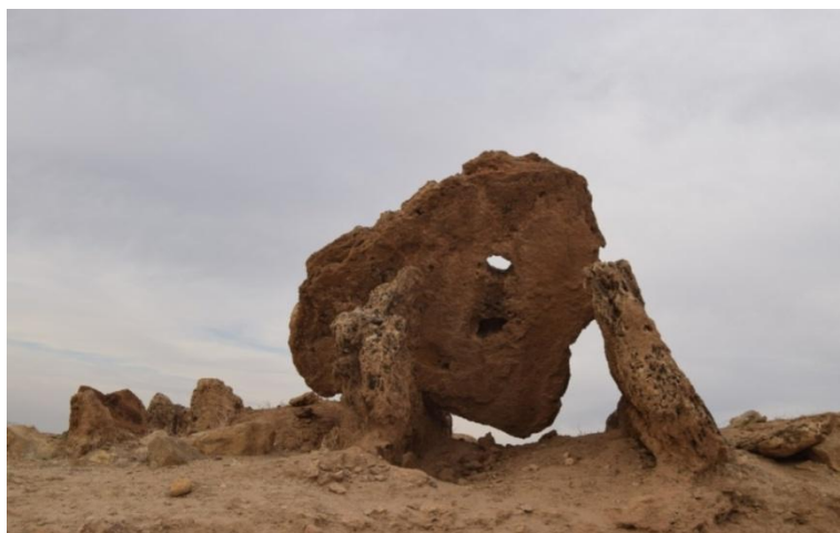
Fig.2: Few dolmens still existed in the area near 'Ain Saleem ( Waheeb, 2020)

By these acts, they only aimed to please God. For example, the name of the priest (Roterrius), who was the head of Wadi al-Kharrar's monastery, was found in the inscriptions found on the Tell.