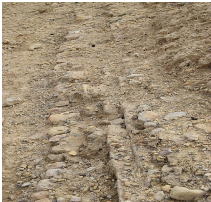
Fig.6: Water channels still visible on the surface of ‘Ain Saleem(waheeb2019)