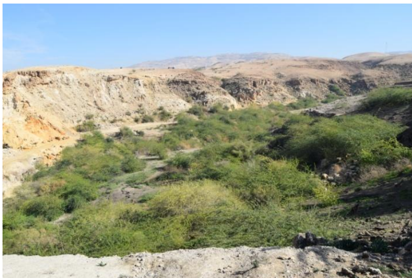
Fig.1: General view of 'AinSaleem close to WadiHesban(Waheeb:2020)

Then the convoys of early pilgrims came to Wadi al-Kharrar,(Harding:UD) which is in the center of Bethany. Where the prophet Elijah was rasping the arrival of Jesus. In the other hand pilgrims and believers also arrived at the place where the Lord was baptized to visit it, get the blessings, and sometimes to even dwell close to it, see fig: 1 (Conder, 1882).