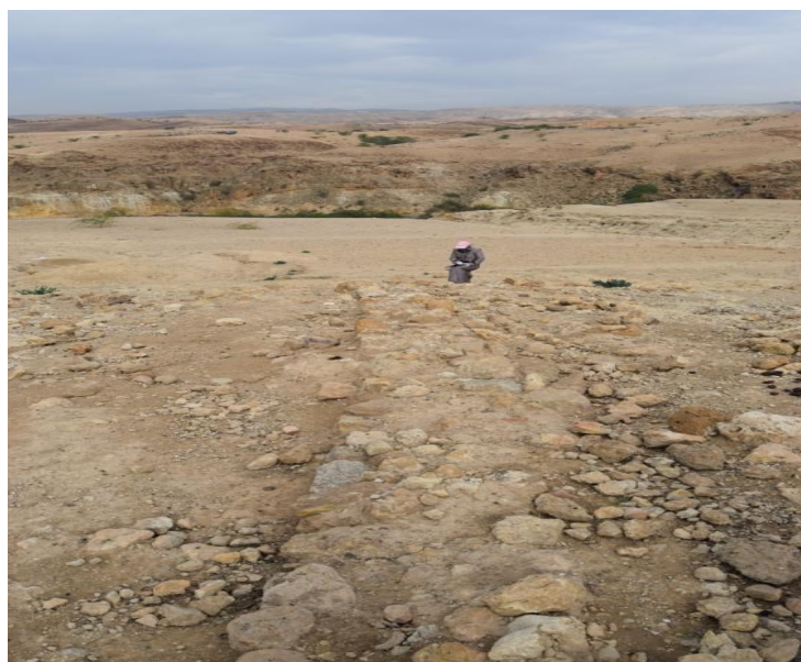
Fig. 5: Walls used to be part of the water system in ‘Ain Saleem(waheeb2019)

The whole area, included the Tell which is overlooking Livias plain, is well watered, and the description of Antonious bring us in fact to springs lying some 6-7km east of site of Jesus Baptism(Bethany Beyond the Jordan)(Fig. 5,6).